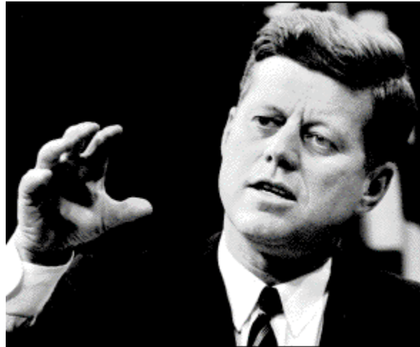
President John F. Kennedy

The assassins reappear, now with Oswald in their ranks. They are united as a force and restate their motives with a final firing of their guns at the audience.