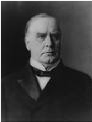
President William McKinley

visitors' hands in the Temple of Music Pavilion. The Balladeer sings a ballad telling of Czolgosz's motivations as he joins the receiving line, gun in pocket. When Czolgosz reaches McKinley he shoots him.