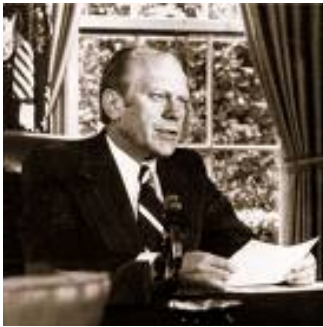
President Gerald Ford

morning, that he calls "I Am Going To The Lordy". The Balladeer describes his trial and execution in ballad form as Guiteau cheerfully sashays up the stairs to the gallows, optimistically singing of heaven. Guiteau is hanged after claiming hauntingly that he will be remembered.